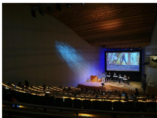
Aula Magna of Stockholm University